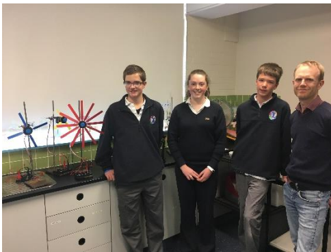
Image 1: Year 8 Crookwell High School students demonstrating what the educational kits can do